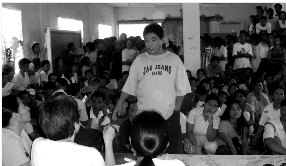
(Upper) Unjustly jailed peasant farmers from Hacienda Matias await a hearing at the Municipal Circuit Trial Court in San Francisco, Bondoc Peninsula. (Lower) Peasant leader recounts harassment to IFFM members during an assembly of the district peasant movement KMBP in San Francisco, Quezon.

dermines the former's ability to construct an adequate rural livelihood and erodes their capacity to sustain their petition. The situation worsens the longer the Comprehensive Agrarian Reform Program (CARP) implementation process drags on. The government, through the Department of Agrarian Reform (DAR), should hasten implementation of CARP so as to make as short as possible the amount of time petitioners have to wait before gaining full ownership and control of the land. We urge the Ombudsman to investigate agrarian reform petitioners' and beneficiaries' com-