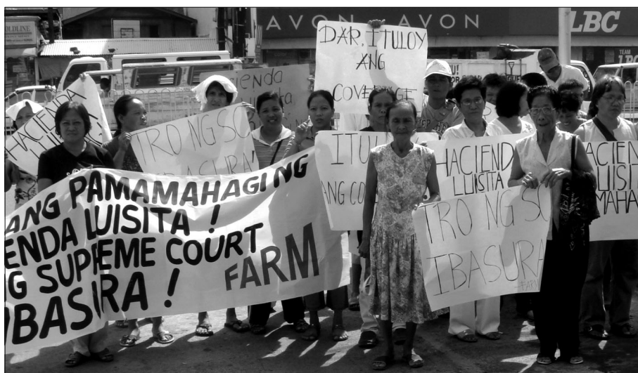
First rally at the Department of Agrarian Reform regional office in San Fernando, Pangasinana, of a newborn alternative farmworkers organization in Hacienda Luisita in June 2006.